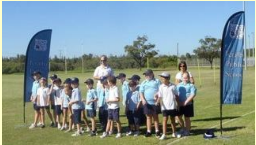
School Cross Country - 9 th April 2012