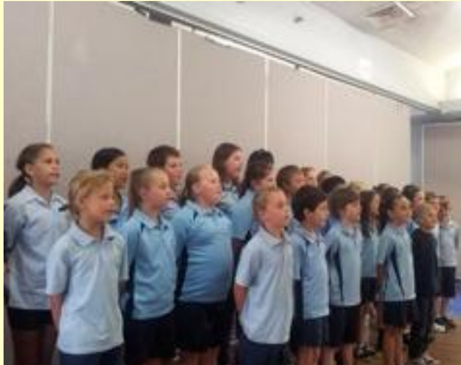
Choir performing at Teralba Bowling Club