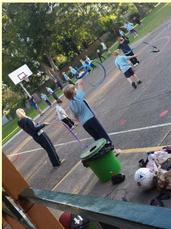
AAS Gymnastics has been great fun in Term 2