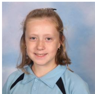
Sport Captain – Hope